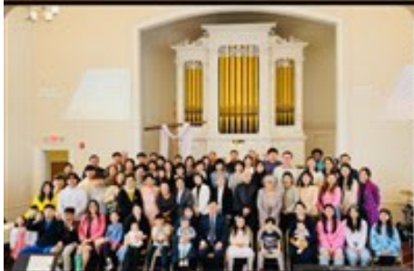
NEW HAVEN KOREAN

1358 NEW BRITAIN AVE | WEST HARTFORD | CONNECTICUT