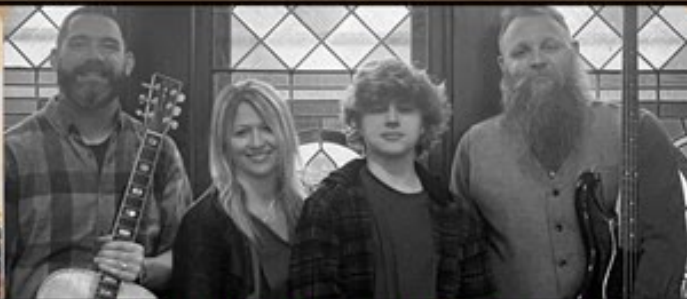
KENSINGTON UMC WORSHIP